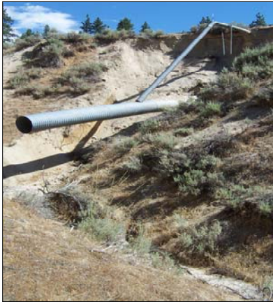
Uncontrolled erosion at culvert outlet

Severe erosion is occurring at several locations in the Clear Creek watershed along U.S. Highway 50 between Carson City and Lake Tahoe. Surface water runoff from seasonal snowmelt and infrequent high intensity rain events causes erosion resulting in the transport of substantial quantities of soil and sediment. Erosion has caused problems related to slope stability along roadways and increased maintenance requirements, especially those associated with drainage structures.