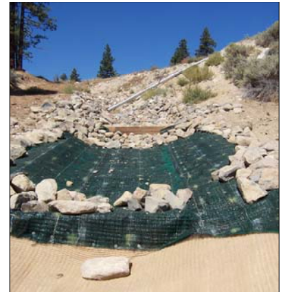
Typical channel test section after channel stabilization and installation of channel lining

Field-testing will enable the performance of RECPs to be monitored under actual field conditions during the winter and spring months when the majority of the runoff events occur. Test plots have been constructed in a channel within the Clear Creek watershed that has experienced severe erosion. Each field plot is 25-feet long and is preceded with a drop structure to reduce the extreme slope of the channel. The two-foot high drop structures were constructed using treated timber. A five-foot riprap apron was placed below each drop structure to dissipate energy at the upstream end of each test section. The riprap aprons also act as an anchoring device to secure the leading edge of the RECPs. The field performance of four different RECPs is being evaluated.